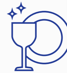
KITCHENS & CATERING

Dominant's range of products are focused on cleaning non-surgical areas in health care facilities. We service specialised areas within health care facilities including: