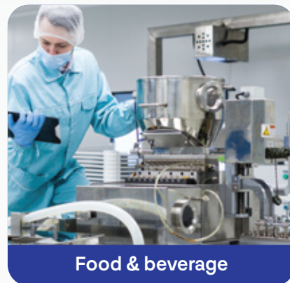
Food & beverage