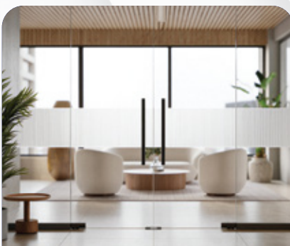
Glass doors & reception areas