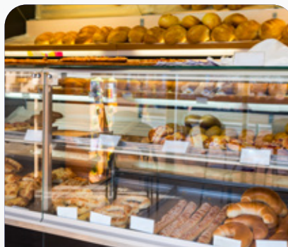
Display cabinets & counters

For best results, use a microfibre cloth.