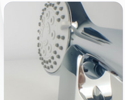
Chrome fixtures & fittings