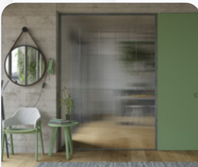
Mirrors & glass partitions