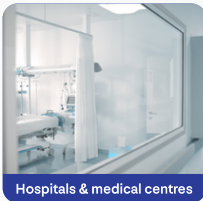
Hospitals & medical centres